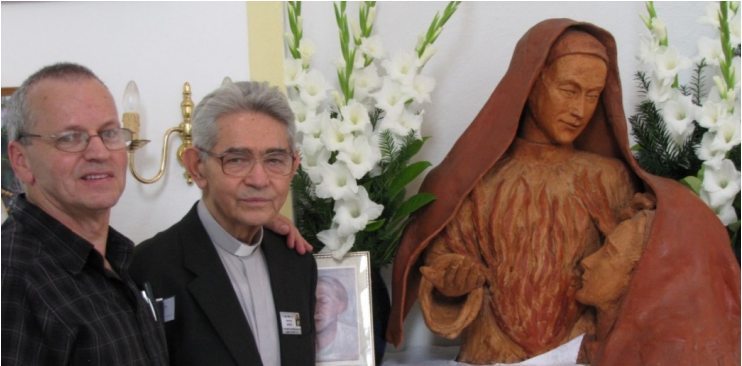
VIRGIN MARY: «Take this Flame; you are the first one I am handing it to. This Flame is, the Love of my Heart, kindle your heart with it and pass it on to others! » (April 13, 1962)