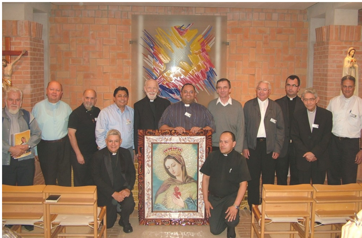
THE PRIESTS ATTENDING THE INTERNATIONAL MEETING