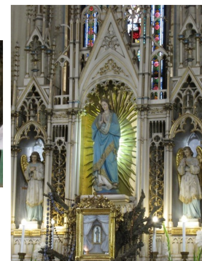
The Altar of the Mariaremete Sanctuary (Refuge of Mary)